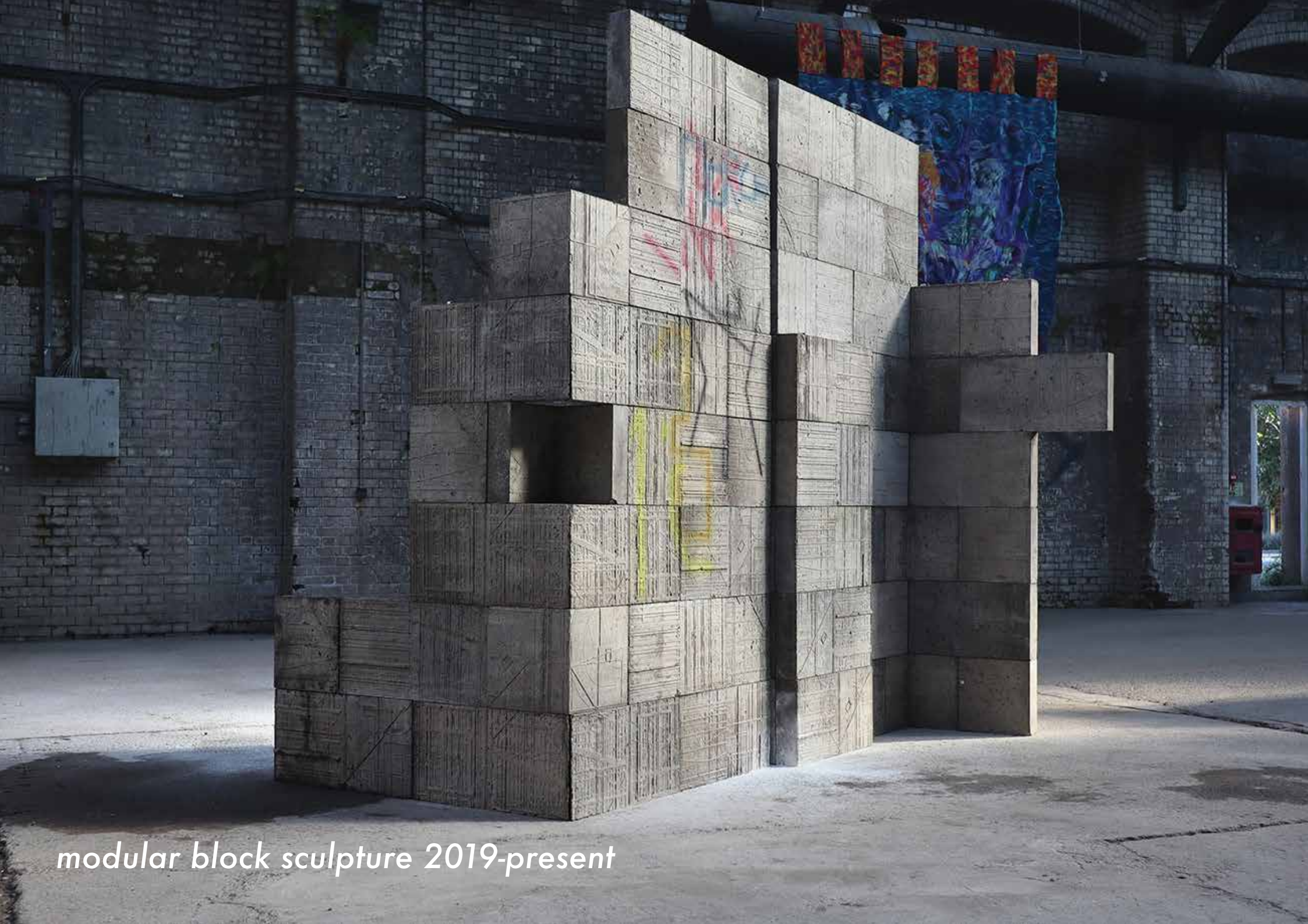
modular block sculpture 2019-present